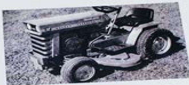
MF 12 G LAWN AND GARDEN TRACTOR