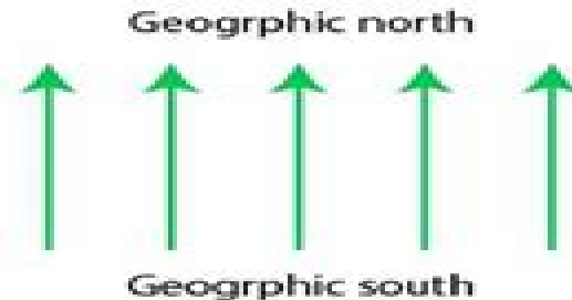
( b ) Lines of uniform magnetic field of earth

Starting from a different point, the process is repeated and another line of magnetic field is traced out. This way a few several lines of magnetic field can be traced out. Every line is required to be labelled with the help of an arrow from the south pole of the needle towards the north pole to represent the direction of the magnetic field. The figure below depicts several magnetic lines that are obtained this way.