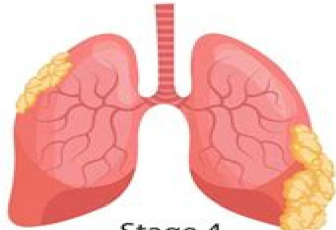
Stage 4 Tumors nearly encapsulate the lung