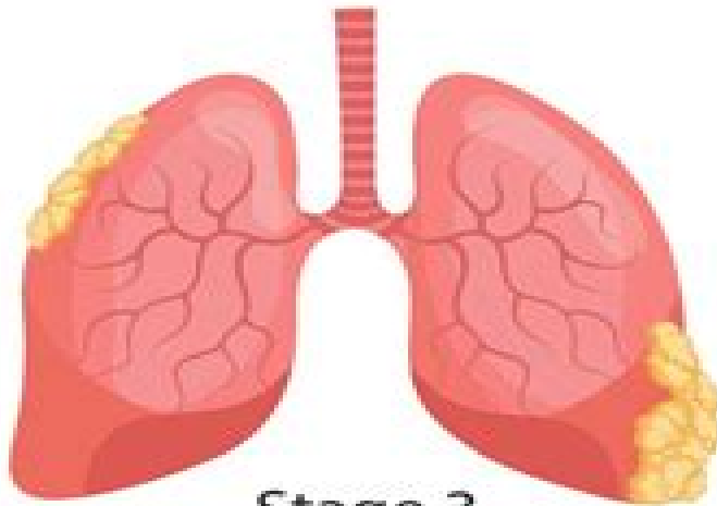
Stage 3 Tumors keep spreading on the pleura