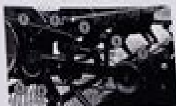
Fig. 23 - Reel Drive Belt