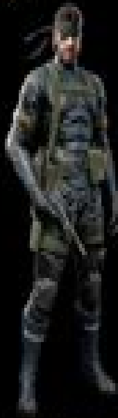
Sneaking Suit (Pth ver.)