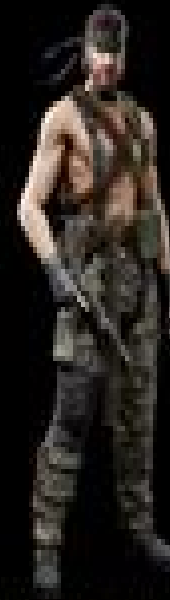
Naked (Armourless Suit)