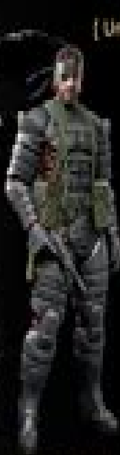
Snake (Green (Pth ver.))