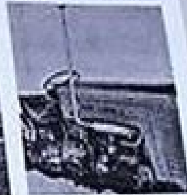
Fig. 11 - Horizontal Exhaust Pipe