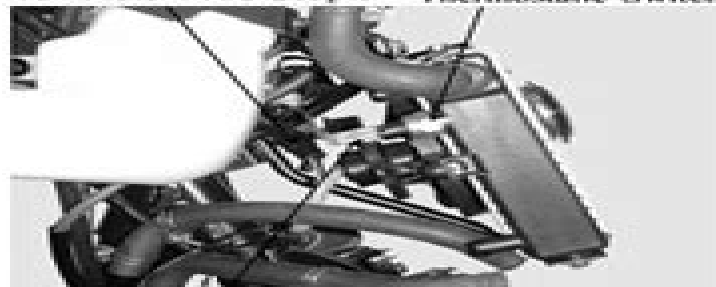
Thermostatic Switch Wire

Remove the two bolts and one nut on the radiator.