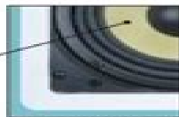
Woven Kevlar Cone with Rubber Surround