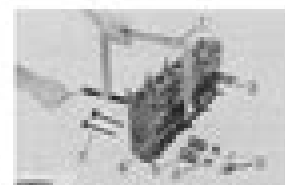
(1) Valve spring/retainer (2) Valve spring (3) Valve (4) Valve spring retainer (5) Valve stem and (6) and the valve (7)