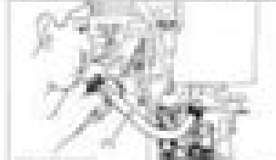
Fig. 3 Valve Train