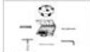
Fig. 3 Valve Seat Cutter Set