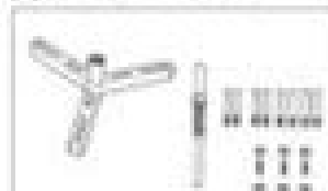
Fig. 1 Flywheel Puller