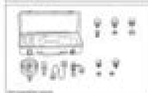
Fig. 5 Oil Pressure Tester