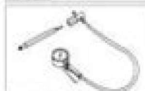
Fig. 4 Compression Tester