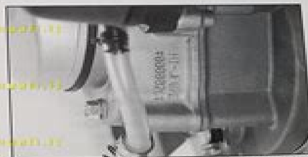
2) Il numero di serie del motore è stampigliato sulla parte posteriore del carter sinistro