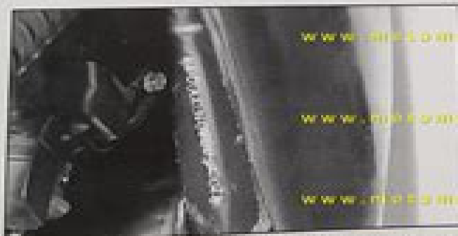
1) Il numero di serie del telaio è stampigliato sulla parte posteriore destra del telaio