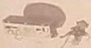
Radio system operation

The information in this manual is for the purpose of providing a general overview of the system and its components. It is not intended to be a complete guide to the system and its operation. For more detailed information, refer to the service manual for the specific model of the system. The system is designed to provide a reliable and efficient means of communication. It is capable of operating in a variety of environments and under a wide range of conditions. The system is designed to be easy to install and operate, and it is capable of providing a high level of performance. The system is designed to be compatible with a wide range of equipment and accessories. It is capable of operating with a variety of different types of equipment, and it is capable of providing a high level of performance with a wide range of accessories. The system is designed to be easy to maintain and repair. It is capable of operating for a long period of time without the need for frequent maintenance or repair. It is also capable of being repaired quickly and easily, and it is capable of providing a high level of performance after repair.