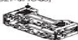
* Screw (4x16) (N64-4016-46)