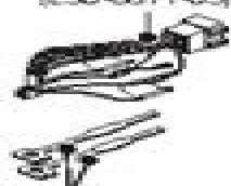
Lever (D10-7012-04) x2