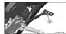
B. Feet Braking Posture