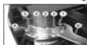
A. Spring Preload Adjuster

Turn the adjuster counterclockwise to increase spring preload and stiffen the suspension. Turn the adjuster clockwise to decrease preload and soften the suspension.