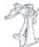
Fig. 51A-09-02 - Soporte motor completo, con 17-0-8805