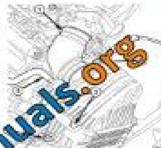
Fig. 19. Removing Front Suspension Components To Fit Power Steering Belt

Remove the front wheel assembly. Remove the front wheel assembly.