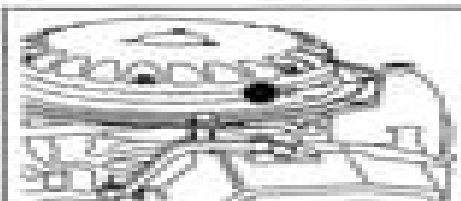
Fig. 8. In most cases, models that require periodic lubrication provide easy access to the starter pinion.