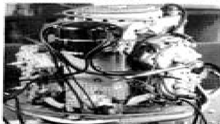
Removing the spark plugs for inspection. Worn plugs are one of the major contributing factors to poor engine performance.

If the powerhead shows any indication of overheating, such as discolored or scorched paint, especially in the area of the No. 1 cylinder (top on 3-cylinder units and top