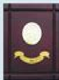
JPA Prize Medal

The great contributor awarded the 2016 JPA Prize was as follows: