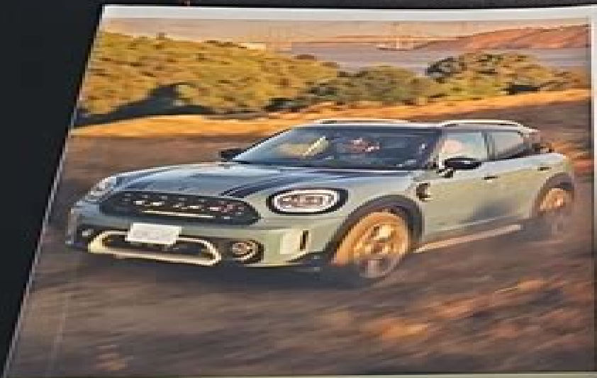
OWNER'S MANUAL MINI COUNTRYMAN.