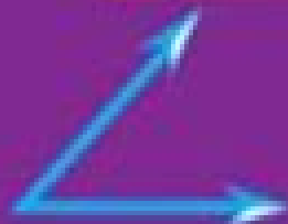
Acute Angle (less than 90°)