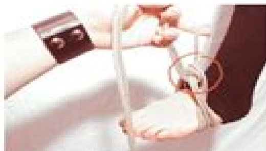
Step 4: tie an over-hand knot through all coils, as shown