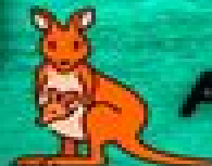
Diagram of a Kangaroo