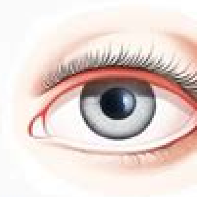
Sensibilité à la lumière