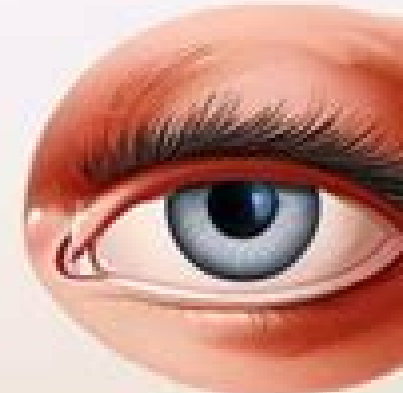
Asymétrie des paupières