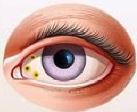
Sensation de corps étranger