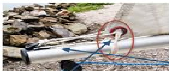
Tie clew to boom