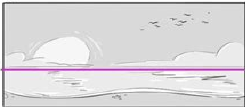
low horizon line