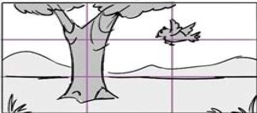
Avoiding the middle