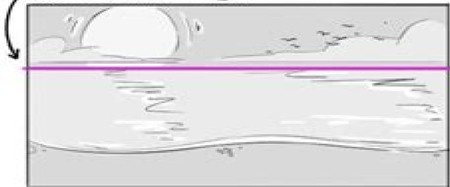
Horizon line high