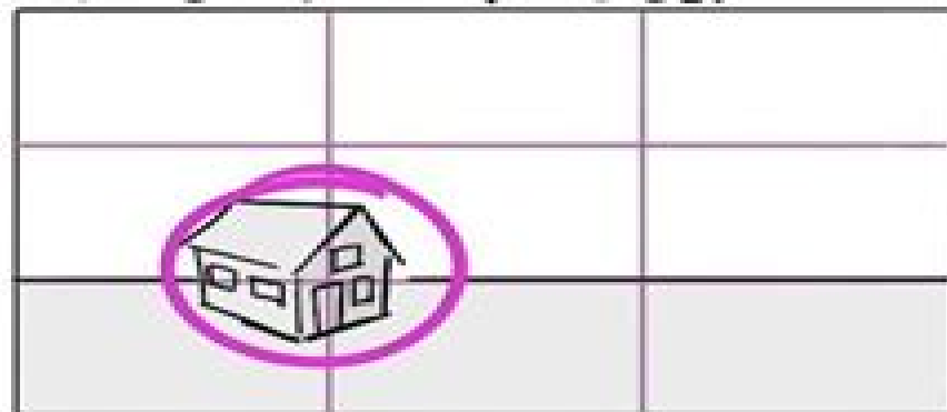
Adding a point of interest