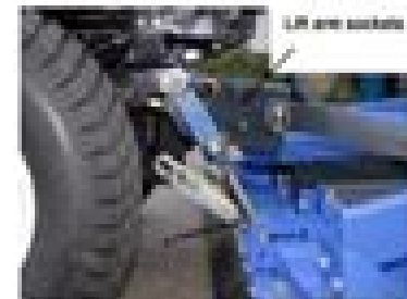
Fig. 2 Rotary Deck Mounting Plates