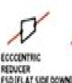
ECCENTRIC REDUCER FSD (FLAT SIDE DOWN)