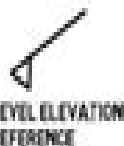
LEVEL ELEVATION REFERENCE