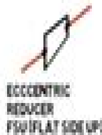
ECCENTRIC REDUCER FSU (FLAT SIDE UP)