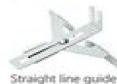
Straight line guide