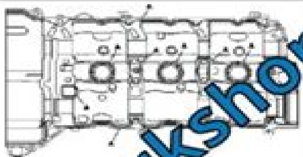
Fig. 13. Microfibrillar Scale.

Thick removal from the cylinder head and cylinder consistent of an engine should together be as much as 0.010 in. If the cylinder head contact surface is machined, the valve seats must be reset.