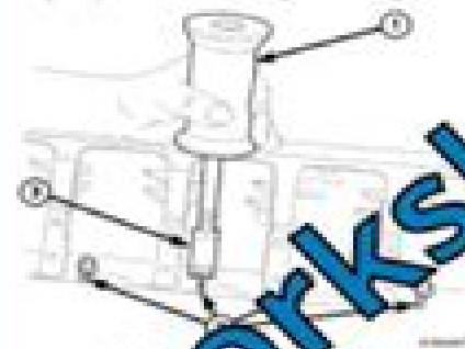
Fig. 32 OIL JET INSTALLATION

The engine must be removed from the vehicle and completely disconnected to replace the oil jet.