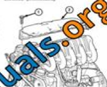
Fig. 37 ENGINE COVER