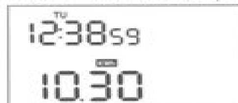
IMAGEN 8 Visualización del consumo de energía