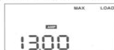
IMAGEN 10 Visualización de la carga máxima