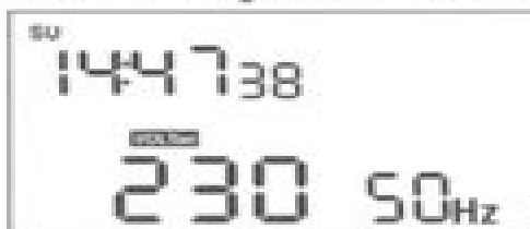
IMAGEN 4 Visualización de la tensión alterna