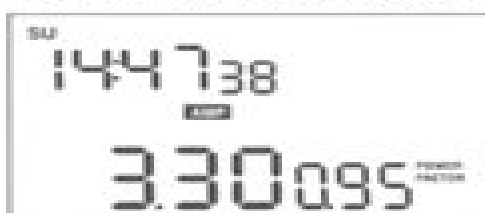
IMAGEN 5 Visualización de la intensidad de la corriente