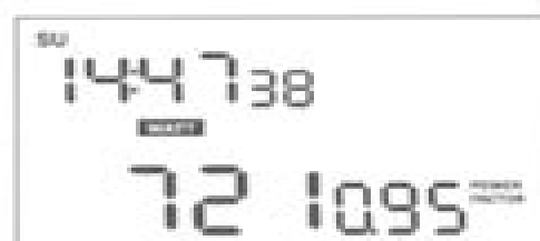
IMAGEN 6 Visualización de la energía absorbida