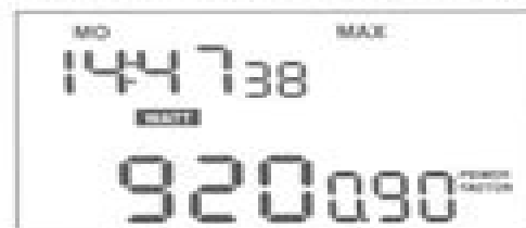
IMAGEN 7 Visualización de la potencia máxima