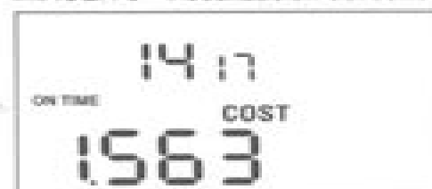
IMAGEN 9 Visualización de los costes