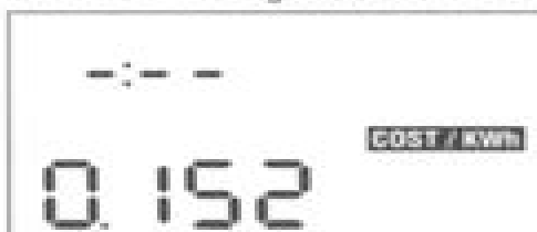
IMAGEN 3 Programación de la tarifa local