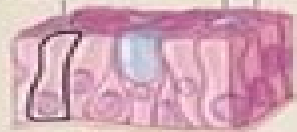
Pseudostratified columnar cell