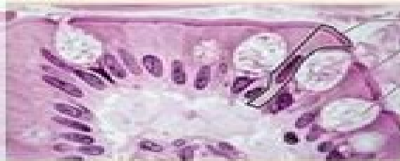
Columnar epithelial cell