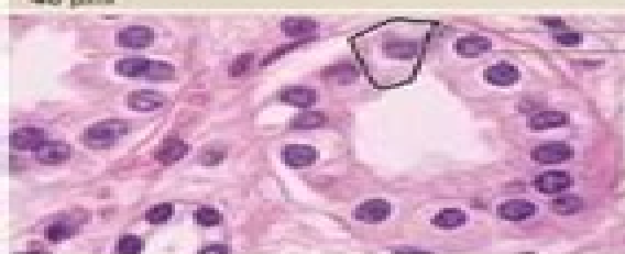
Cuboidal epithelial cell