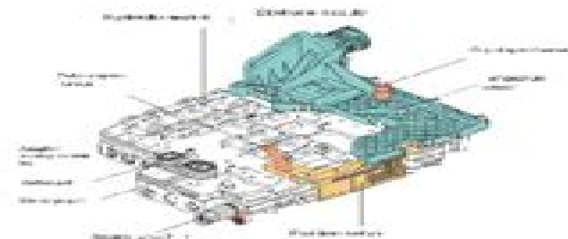
VALVE BODY TCM ASSEMBLY