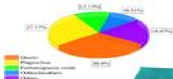
Mineral Composition of Green Sandstone

1. Which mineral is the main component of green sandstone?