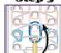
Grab the blue band on the center pin