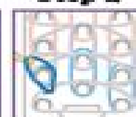
Loop the blue band straight up to the next pin