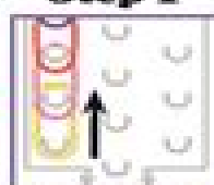
Place bands on the left row of pins