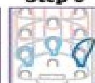
Loop the blue band straight up to the next pin

Step 7: Continue picking up and looping the bands until you reach the top of the loom. Finish the bracelet with a white extension and C-clip. (see reverse)