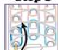
Grab the blue band on the left pin