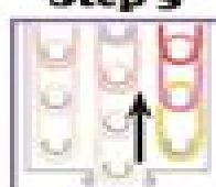
Place bands on the right row of pins