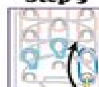
Grab the blue band on the right pin