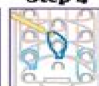
Loop the blue band straight up to the next pin