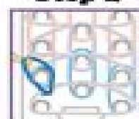
Loop the blue band straight up to the next pin