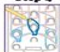
Loop the blue band straight up to the next pin