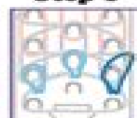
Loop the blue band straight up to the next pin

Step 7: Continue picking up and looping the bands until you reach the top of the loom. Finish the bracelet with a white extension and C-clip. (see reverse)