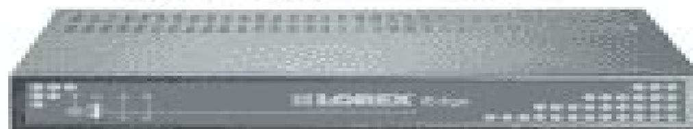
Lorex Edge 2000 16CH DVR