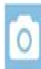
Foto 3 Mpx