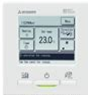
«WIRED TOUCH REMOTE CONTROL» RC-E3X series