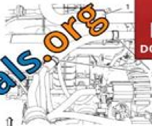
Fig. 8. Remove Crankshaft, and ECM Wiring, Remove, Remove, Open