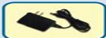
5V 2A DC Power Adapter