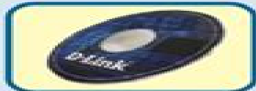
CD-ROM with Manual