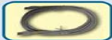
Ethernet (CAT5e UTP/Straight-Through) Cable