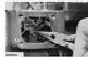
(1) Injection Pump Cover (2) Fuel Pump Cover