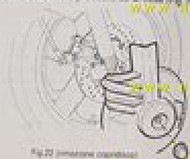
Fig. 22 (rimozione copridisco)