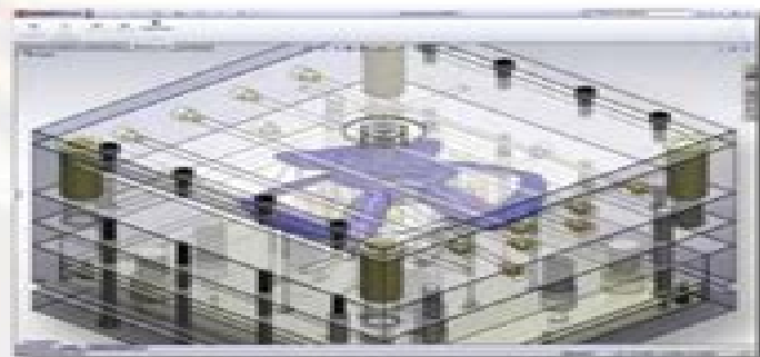
Mold design courtesy of R&B Mold and Design.

This issue of Mastercam Notes focuses on the new Mastercam for SolidWorks product by explaining exactly what it is, describing the process, and backing it up with a few customer testimonials. We hope you find this new product as exciting for your shop as we do!