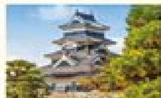
① Matsumoto Castle

If you want to make the most of your trip in Eastern Japan, we recommend a visit to the Nagano and Niigata areas. Both are relatively close to Tokyo and offer a wide variety of sightseeing spots, including leisure facilities such as hot springs and ski resorts - all surrounded by stunning views.