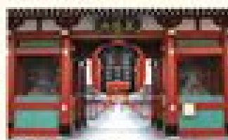
⑧ Tokyo (Senso-ji)