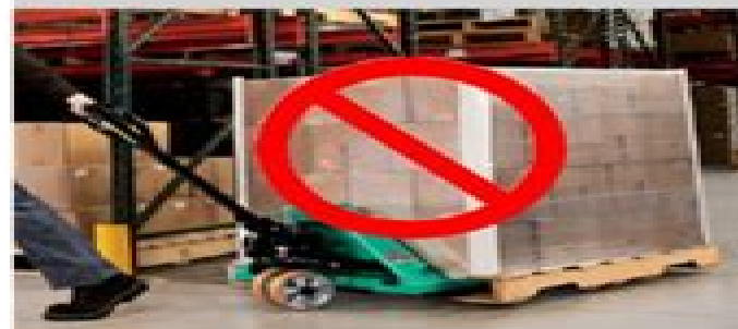
Avoid pulling the load when possible!