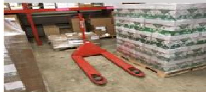
Park out of the pathway!