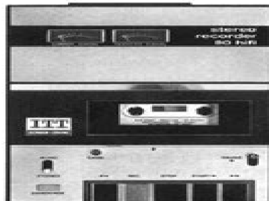
Typ 5332-01 00 Metall / schwarz metal / black