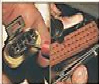
Fig. 3.1. Exemplo de verificação de continuidade no chicote do sensor VSS (entre os bornes 2 do sensor e 28 do MC).