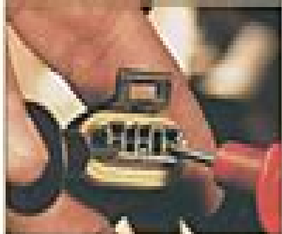
Fig. 2.2. Modelo de teste de alimentação do sensor VSS.