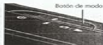
Botón de modo

Pulse el botón de modo, luego ▲▼ hasta que la pantalla LCD muestre el modo de captura que mejor se adapte al objeto y entorno enfocados y, a continuación, pulse OK (Aceptar).